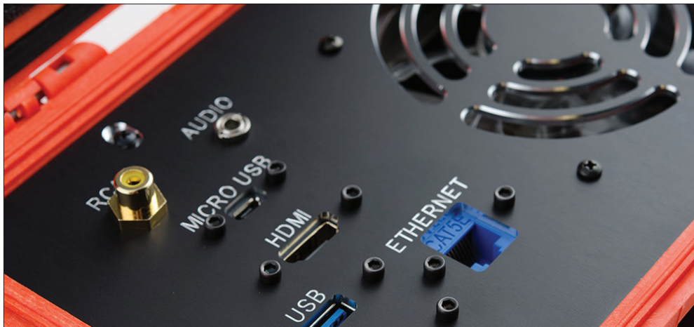
A custom panel that provides access to the electronics housed within a ruggedized Pelican case. Making custom panels like this represents an area of specialization for DataPro International.

DataPro's popular Online Plate Designer allows engineers and non-engineers alike to customize a wide variety of plates and panels through a simple web-based interface. Requiring no experience in CAD or 3D modeling, it shows a graphical representation of the final product, and orders can be placed immediately. On the back end, as soon as an order is placed, custom software automatically generates GNC code, and the plate is ready to be machined within minutes. For more complex projects, DataPro offers expert engineering and design services, working with customers on both initial design and manufacturing process development.